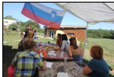
Outdoor common areas where to live, eat, work, rest, meet, sunbathe...