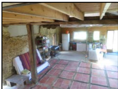
Indoor common areas where to live, cook, work, rest, have fun... and in case of rain !