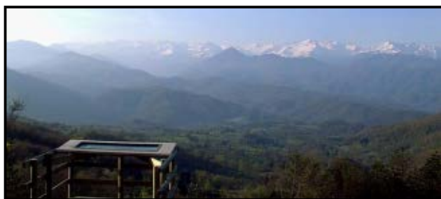
At the foot of the Pyrenees...

This place allows us countless possibilities for workshops, activities, parties.