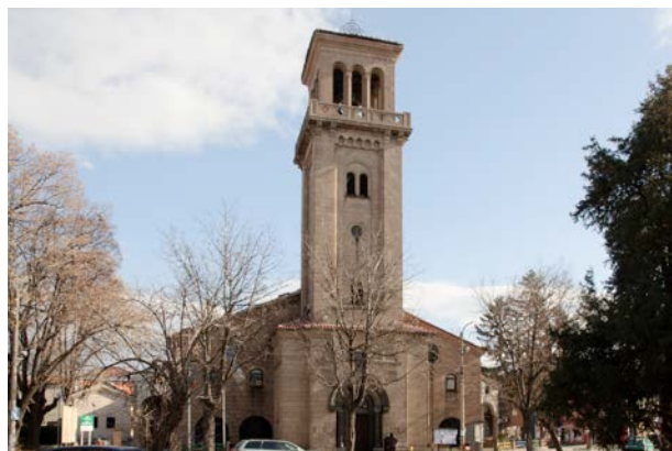
Dormition of the Theotokos Church

Pazardzhik Point on Snow Island in the South Shetland Islands, Antarctica is named after Pazardzhik.