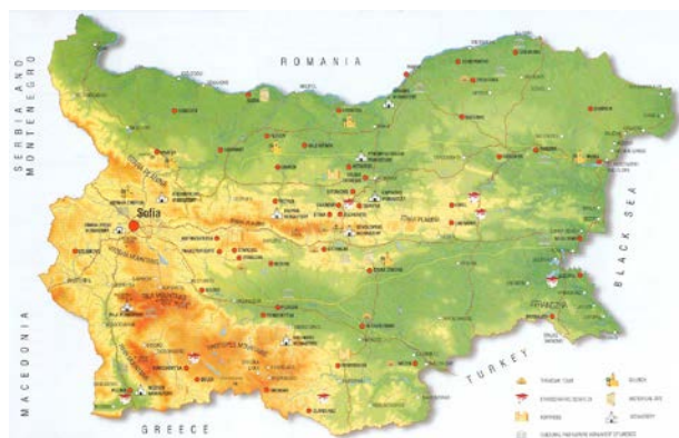
Map of Bulgaria

А Б В Г Д Е Ж З И Й К Л М Н О П Р С Т У Ф Х Ц Ч Ш Щ Ъ Ы Ю Я а б в г д е ж з и й к л м н о п р с т у ф х ц ч ш щ ъ ь ю я