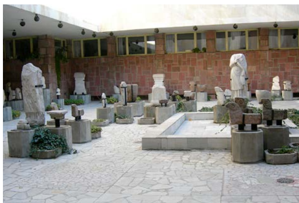
Pazardzhik History Museum