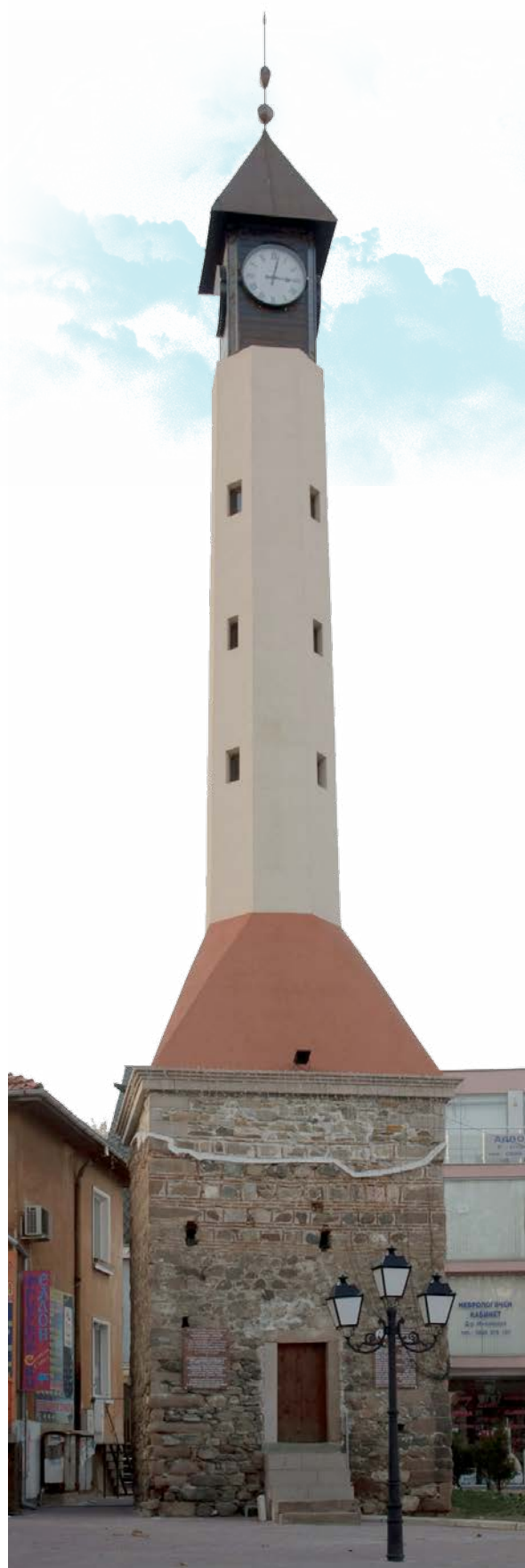
The old clock tower is one of the landmarks of Pazardzhik.

From the early 20th century on people built factories, stores and houses, and thus the industrial quarter of the town. From 1959 to 1987 Pazardzhik was again an administrative centre for the region, and is again since the 1999 administrative division of Bulgaria.