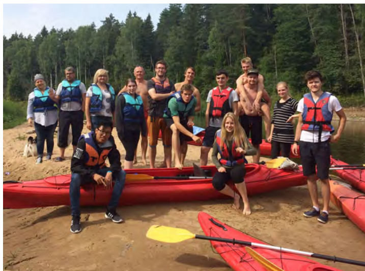
Foundation's team on boat trip in August 2017: staff and volunteers, some board members and EVS volunteers

You will find it here: www.youtube.com/ValmierasFonds